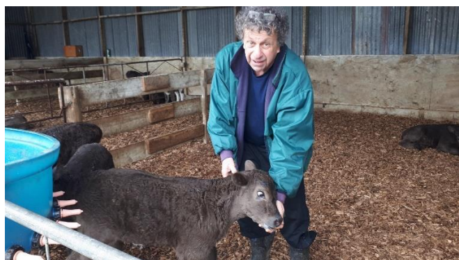
The milk took second place!