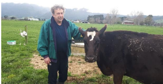
Yes, I was there too!