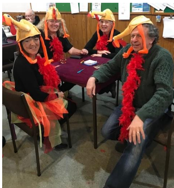
not sure of the quality of the eggs our male would produce! He looks a bit down

though I was less clear of the relevance of the chocolate eclairs to any theme... But, wow, they were nice!